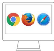
PC and Mac Chrome | Firefox | Safari